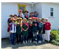
The Marching Crew!