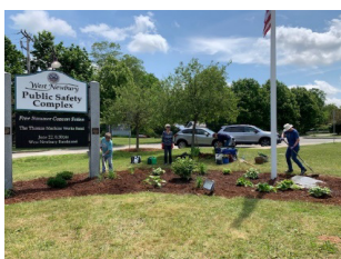
The Planting Crew!